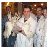
Fig. 7. Kierunek i natężenie zmian gospodarki rolniczej.